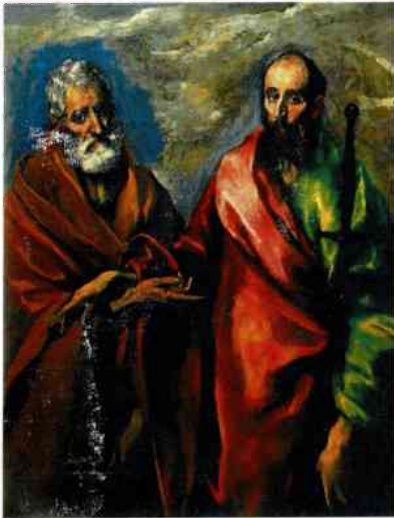
St. Paul and St. Peter - El Greco, 1595

June 2015/July 2015 50p per copy (£3 per year)