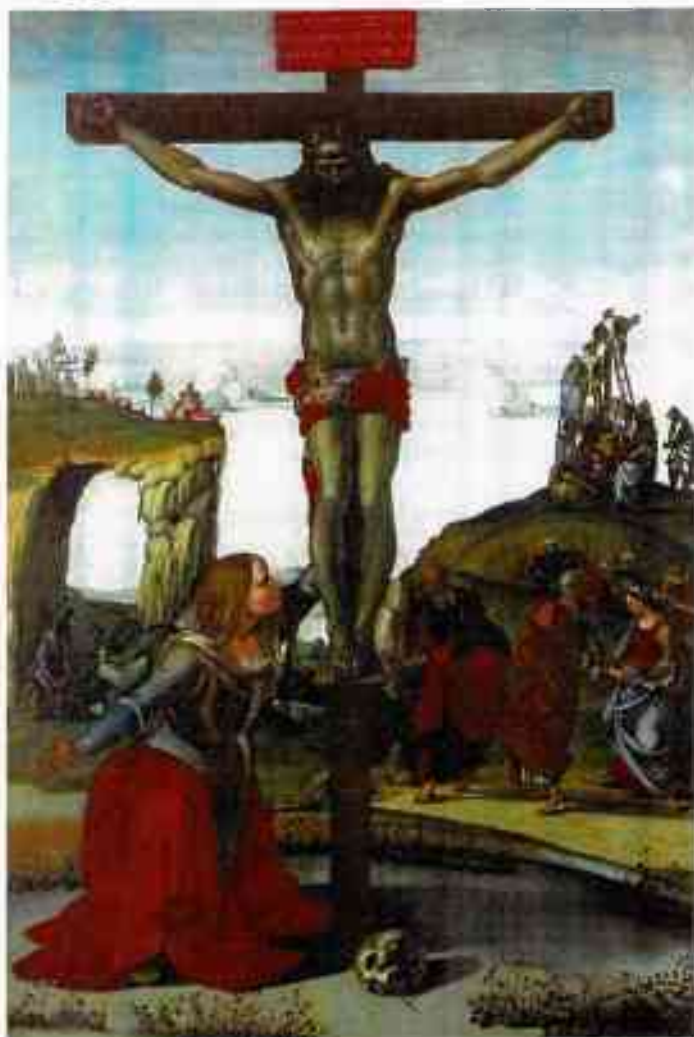
The Crucifixion with St. Mary Magdalen Luca Signorelli

April 2015/May 2015 50p per copy (£3 per year)