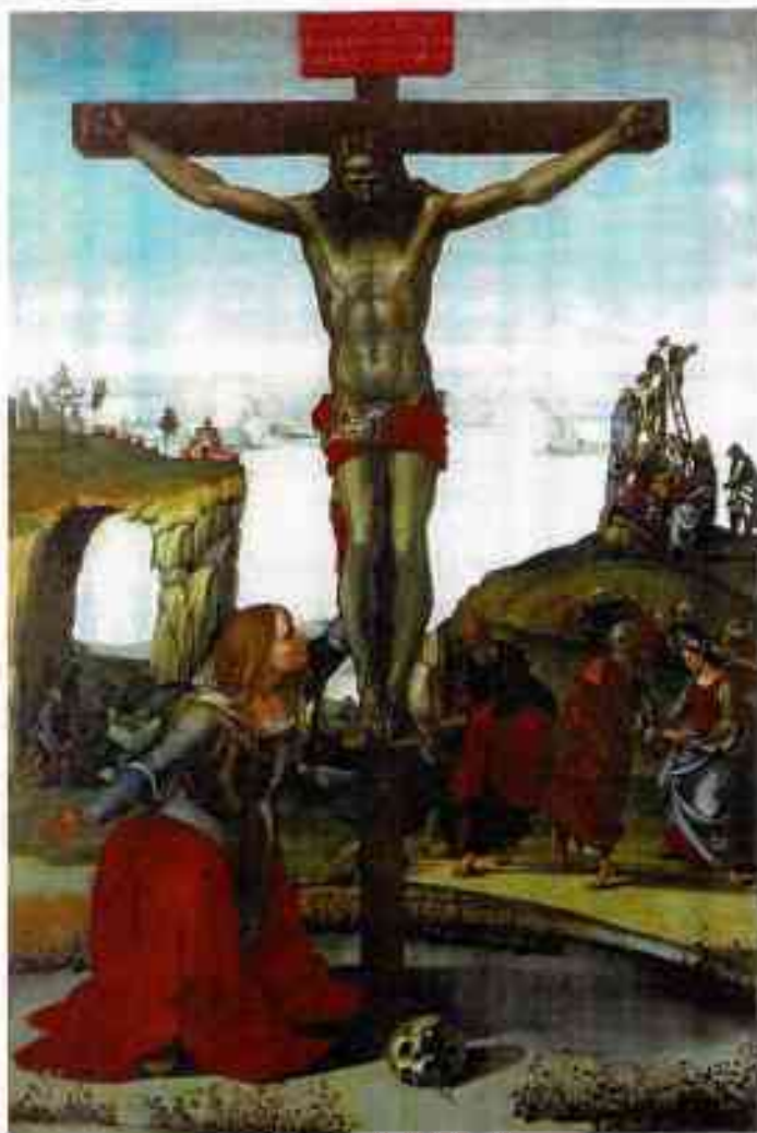
The Crucifixion with St. Mary Magdalen Luca Signorelli

April 2015/May 2015 50p per copy (£3 per year)