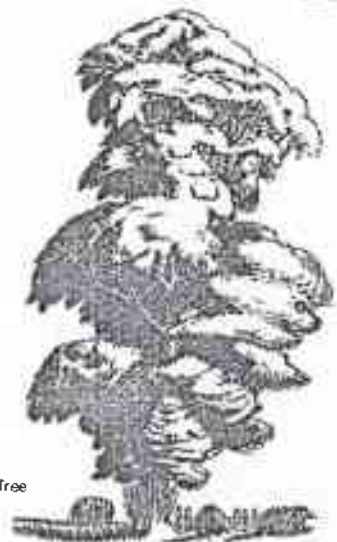
The Elm Tree