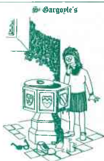
The thing in the font had claimed another victim . . .