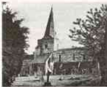
The Church from the N W