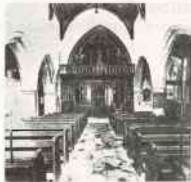
The Church interior

To preserve the centre of worship for future generations, it is essential to maintain the fabric of this beautiful Church and we are facing the task of raising