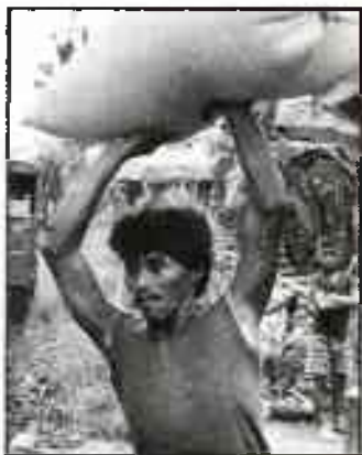
Food prices are rising in the Philippines.

Tax collecting or collecting in Christian Aid Week may not be the most popular or easy thing to do. But on this occasion the 'tax' or community charge is entirely fair, and if we catch sight of Jesus, as Zacchaeus the tax collector did a long time ago, and help others to catch sight of him as well, we may even enjoy a widespread burst of fair-mindedness and generosity.