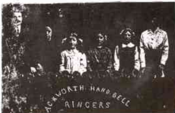
HAND BELL TEAM 1916