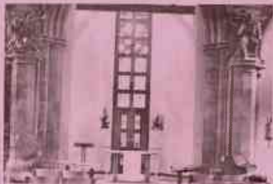
The Worship Area

The building speaks of God and is itself part of our worship. The chairs, gathered around the Altar express the corporate nature of Christian life.